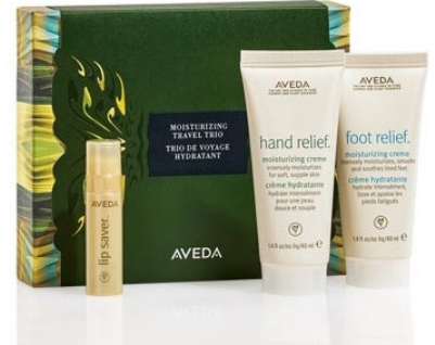
Moisture Travel Trio: Hand Relief™ 40ml + Foot Relief™ 40ML + Lip Saver SRP €35