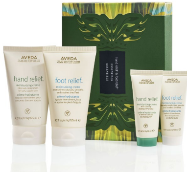
Hand & Food Relief: Hand Relief™ 125ML + Hand Relief™ 40ML + Foot Relief™ 125ML + Foot Relief™ 40ml SRP €65