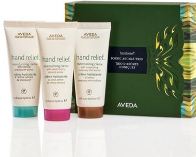
Hand Relief Iconic Trio: Hand Relief™ w/ Shampure™ Aroma 40ml + w/ Rosemary Mint Aroma 40ml + w/ Cherry Almond Aroma 40ml SRP €28